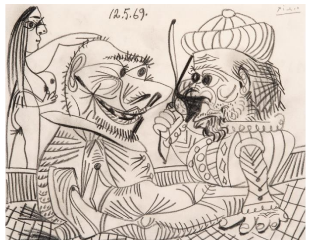
Pablo Picasso, Nu et deux personages , 1969, pencil on paper.

The exhibition Pot-pourri. From Picasso to Valdés. The Braglia Collection will open to the public on the 28th of September .