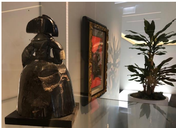
Manolo Valdés, Menina VII , 2004, lava stone, h. 25 cm

Studying, observing and reinterpreting the masterpieces of art history is the characteristic feature of the Valdés practice. The reference is evident in the series of sculptures entitled Las Meninas , of which our sculpture is part, and for which Valdés took as its point of inspiration the painting with the same title made by Diego Velázquez in the mid-seventeenth century. Menina VII offers a harmony of classical echoes that guide us towards the end of an exciting journey that has attracted the attention of more than two thousand visitors.